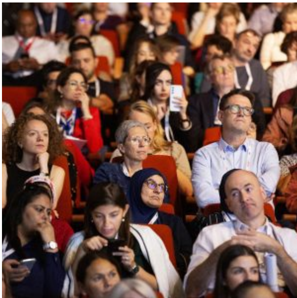
Genetic Diagnosis Challenges

The Educational Day on the first day of the meeting remained a key highlight, delivering easy-to-understand, interactive sessions on the latest updates in Chronic Granulomatous Disease, Activated PI3K Delta Syndrome (APDS), genetic diagnosis challenges, and Hematopoietic Stem Cell Transplantation – HSCT for Inborn Errors of Immunity – IEI . These sessions, led by world-leading experts, offered invaluable insights into the clinical and genetic challenges faced by the community.