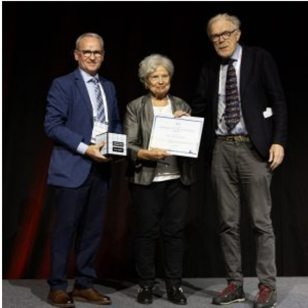
ESID 2024 – Awards