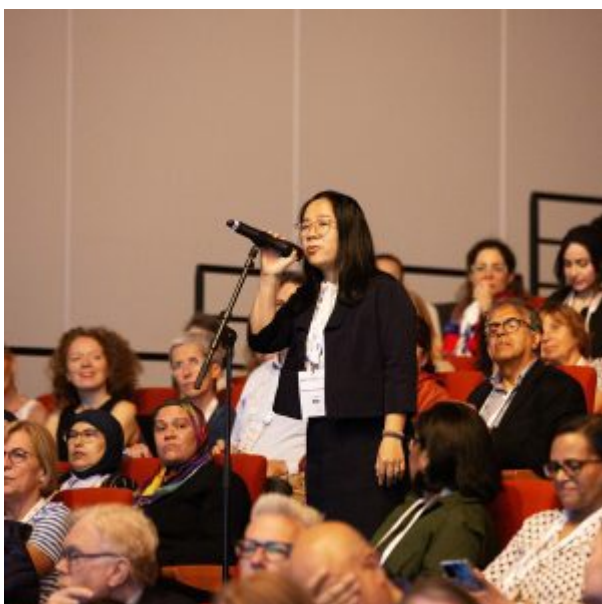
Genetic Diagnosis Challenges