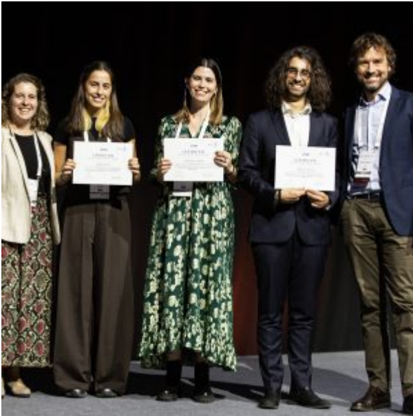
ESID 2024 – Awards